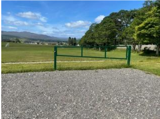
Newly installed vehicle access gate

We were delighted this year to finally take lease of the playing field for 25 years, which will enable us to secure funding and facilitate works to improve the area for the whole community. Thanks to funding from SSE – Achany and Foundation Scotland Rosehall we can now begin this process. The first works to the perimeter have begun and we have now purchased mowers to look after the grass cutting. We hope to have lots more photos of this work next year. Watch this space